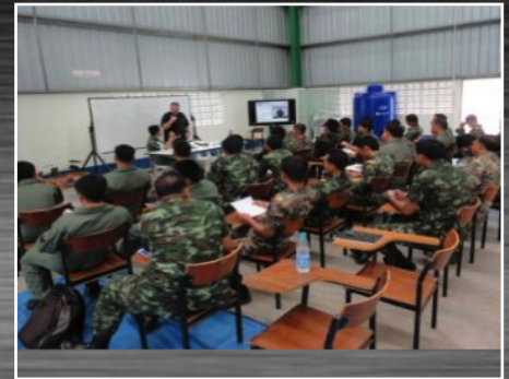
GROUND CREW SCHOOL