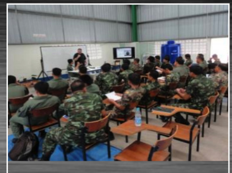
AIRSHIP PILOT TRAINING