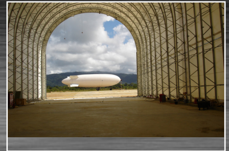
CUSTOM AIRSHIP HANGARS

Hangars can consist of galvanized steel frames covered with heavy-duty fabric made of PVC, for use as permanent shelters or as temporary solutions for aircraft storage and they support an array of optional accessories. Hangars may be relocated as single units or as disassembled components, can be customized for any aircraft, and fitted with optional environmental control systems.